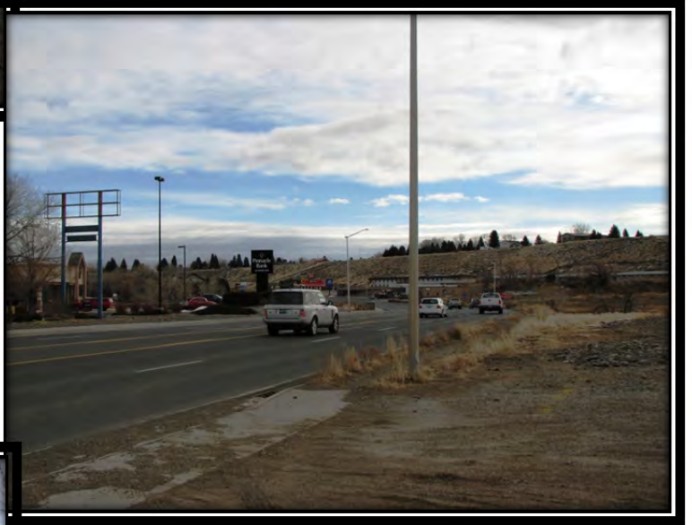
Looking East on Hwy 14-16-20