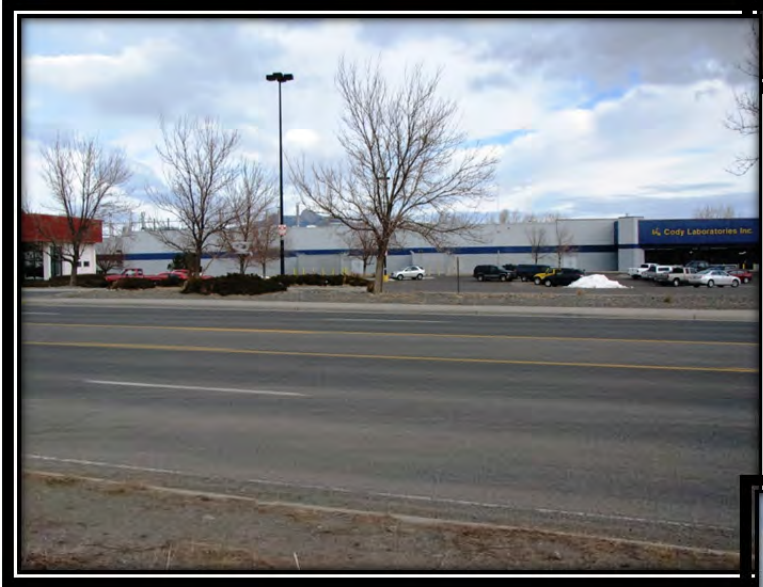
Looking North across Hwy 14-16-20